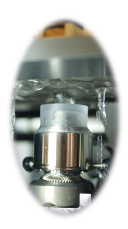
WaterPlume™ ensures the power module's top surface remains dry.

Advanced Sonoscan<sup>®</sup> capabilities such as Visual PolyGate<sup>™</sup>, Movement Map<sup>™</sup>, AutoScan™ and Pixel Pitch™ add value and convenience. D9600Z has the capability to efficiently scan a single Power Module or two Power Modules at the same time.